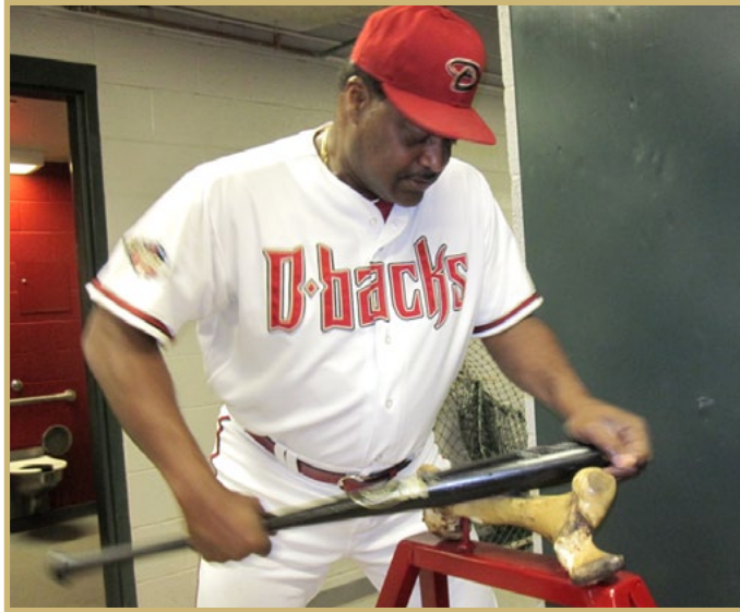
Don Baylor, Arizona Diamondbacks' hitting coach, hones a bat on a device made with an Aggie cow bone.

Does honing bats with Aggie cow bones work? Well, since June, the Arizona Diamondbacks have moved into first place in the Western Division of the National League. Maybe there is something to the magic of honing bats or maybe there is magic to the Aggie cow bones. Can requests from the Texas Rangers and Houston Astros be far behind?