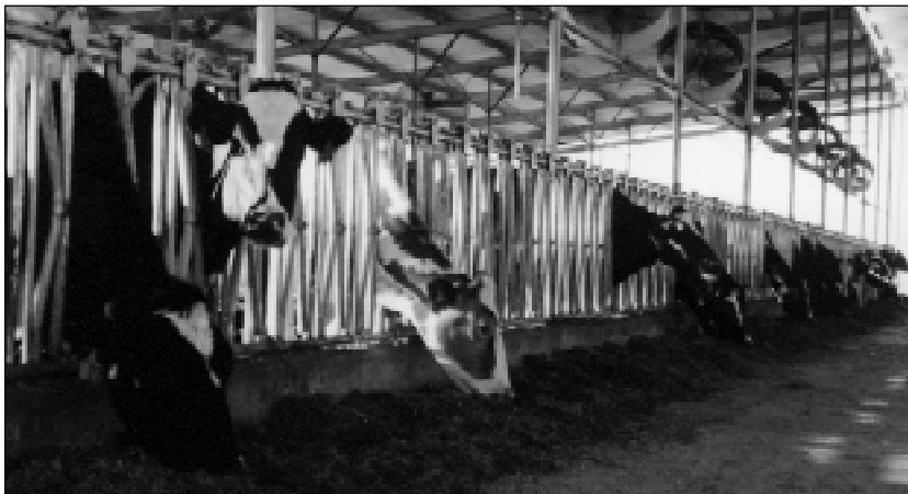
Cows often sort, or selectively choose the palatable parts of the ration and leave the coarser parts that have plenty of effective fiber.

The importance of adequate effective fiber has generated interest in developing ways to assess it on the farm. Analyzing particle size distinguishes the rapidly digestible portion of the ration from