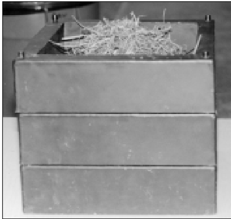
A particle size separator (above) divides forage particles into three categories (below, from left): more than 3/4 inch, 5/16 to 3/4 inch, and less than 5/16 inch.

It is important to evaluate particle size at the bunk where cows are eating feed. Many factors may cause in-