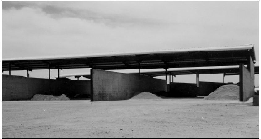
Producers should track feed inventory closely to determine shrinkage and inventory discrepancies.

Recently, dairy producers have begun using flow meters to more frequently monitor milk production of groups or strings. Flow meters that monitor flow of water and other liquids have existed for years; adapting them for use in dairies allows producers to monitor milk production daily. Several types of flow meters are available; most